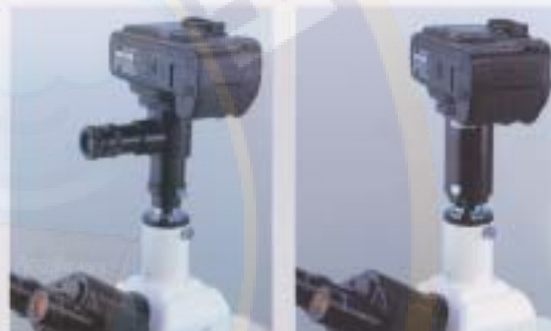
MA150/60 Camera attachment MA150/50 Camera attachment

These attachments are used to mount the camera with T2 adapter ring to the photo tube.