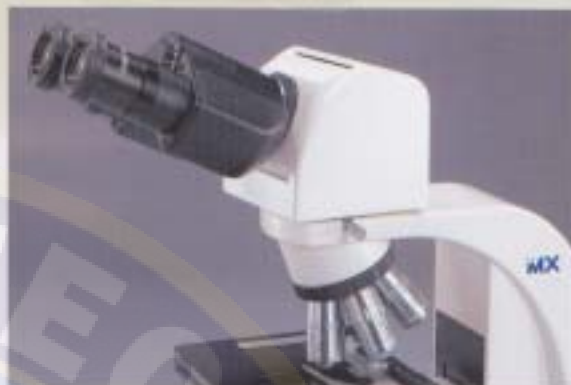
MA957 ERGONOMIC TILTING BINOCULAR HEAD (SIEDENTOPF TYPE)