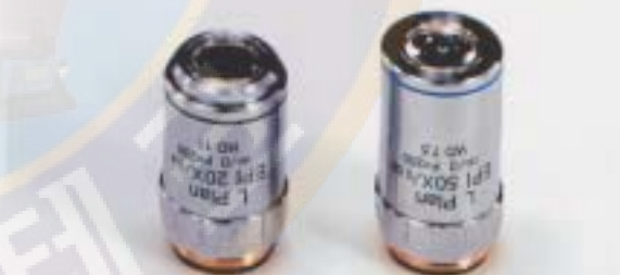
LWD (LONG WORKING DISTANCE) PLAN EPI OBJECTIVES