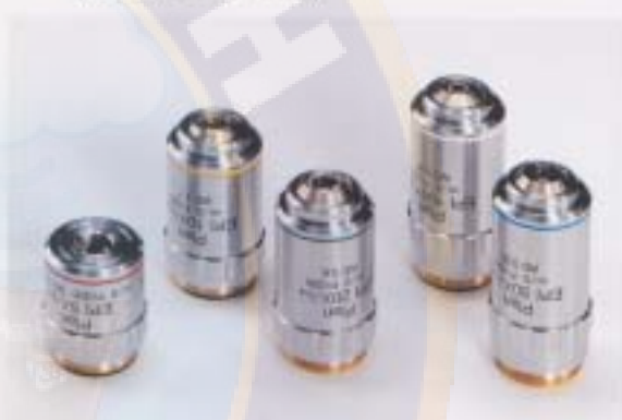
PLAN EPI OBJECTIVES